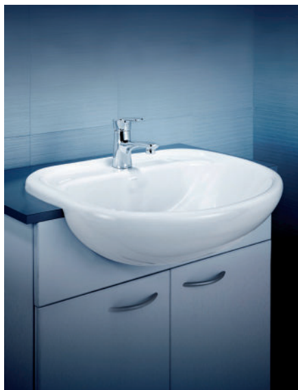
Tapware shown for photographic purposes only.

A modern concept semi recessed vanity basin incorporating functional bowl surrounds with smooth rounded contours for easy cleaning and available in two sizes. The Caravelle 600 and Caravelle 550 are generously sized basins with two soap holders and have been designed to co-ordinate with other products in the Caravelle range. This basin is suitable for domestic, commercial and accessible applications (refer to Compliant Product section).