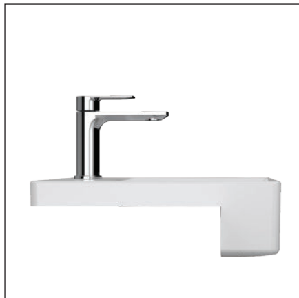
Tapware shown not included.

The Urbane II basin range features refined thin edge details, contemporary rectangular forms, and a practical, easy-to-clean bowl. Designed to enhance the complete Urbane II bathroom collection, the basin range is available in a range of configurations, ideal for general purpose, domestic and commercial applications.