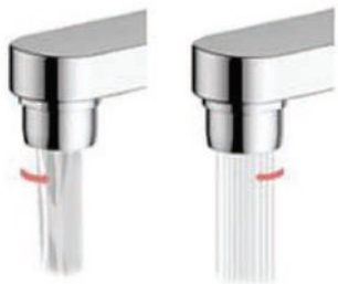
Sink - Dual Spray Aerator Twist to change

BASIN: Fitted with the all-directional aerator.