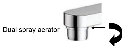
Dual spray aerator