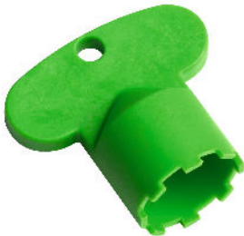
Service key Neoperl © Caché ©, TJ, 18 mm, green