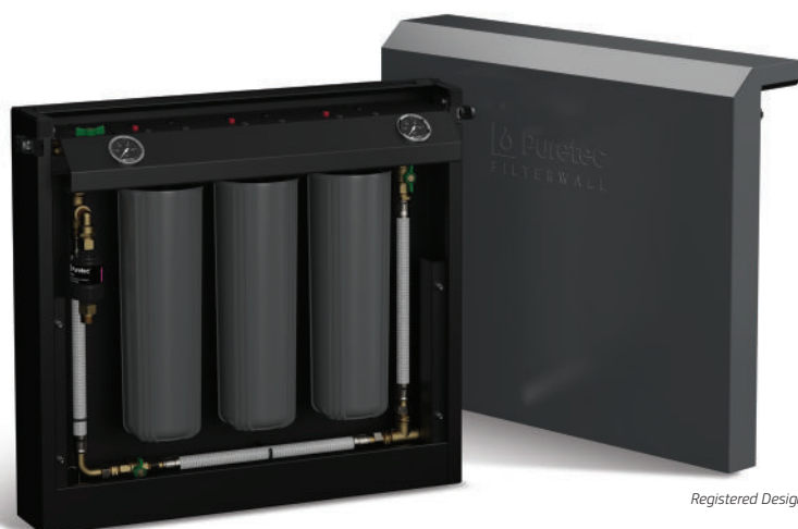
3-Stage Filtration System with bypass and PVM