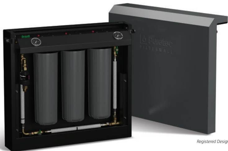
3-Stage Filtration System with bypass and PVM