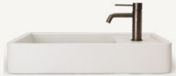
SHELF 03 BASIN