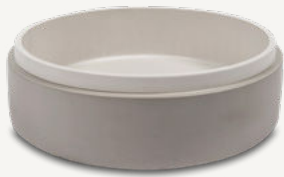
STEPP CIRCLE BASIN