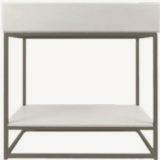
TROUGH BASIN VANITY SET